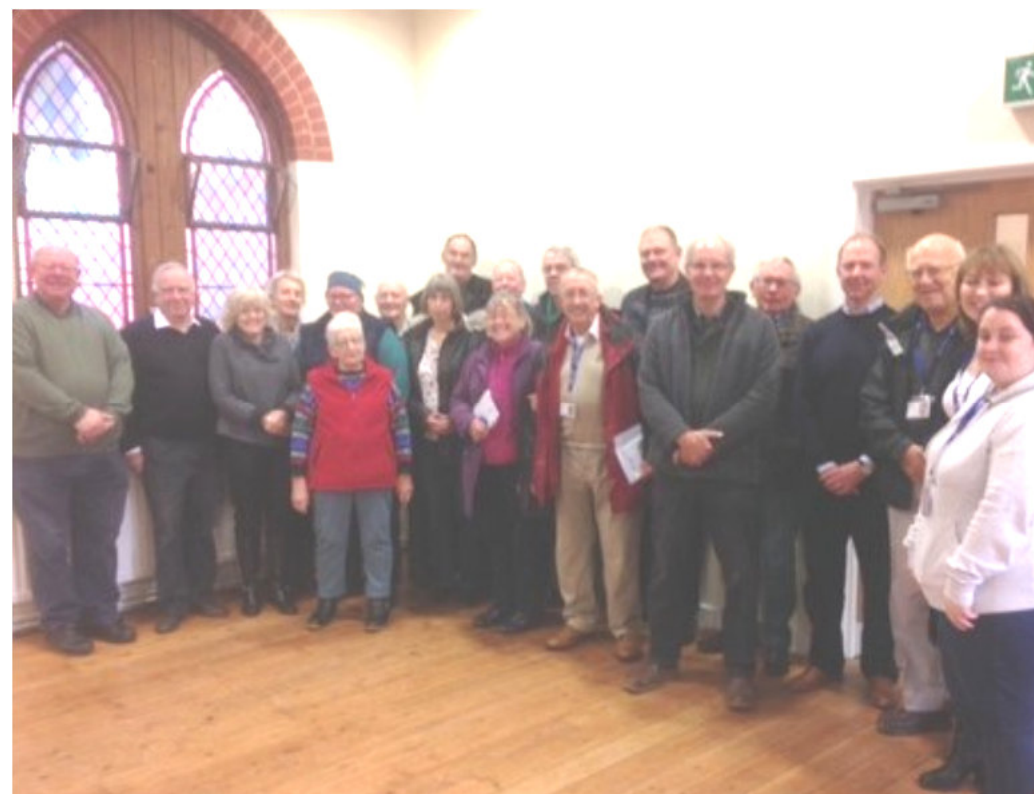
Medical Car Service Team