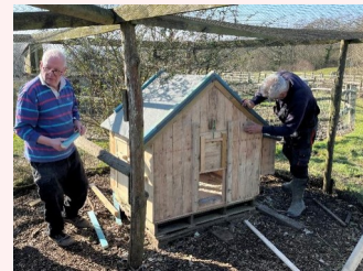
New Chicken House at Little Tinkers