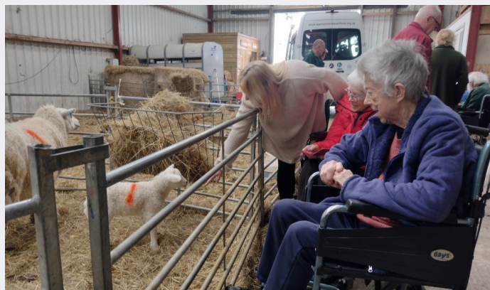
Members & Volunteers enjoying meeting some lambs & sheep

Our Minibuses are often out on different trips. Recently there was an Outing from Oaklands Nursing Home to see the new baby animals at a near by Farm.